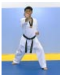
20)Right hand choke grab