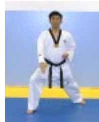
16)Land in front stance open hand low block