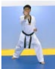
14)Right hand choke grab