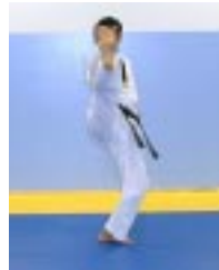
15)Right leg front kick