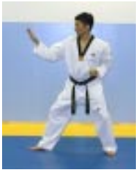
34)Keep left foot on floor and execute a back stance knifehand block