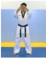
Koryo Ready Stance

On certain motions when changing directions your feet must first come together. This will happen by sliding your left foot to your right foot (* denotes this motion) or by sliding your right foot to your left foot (** denotes this motion).