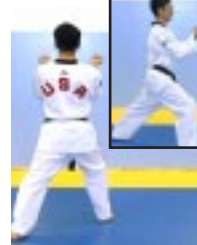
23)180° turn right by stepping forward pivot on right foot double body block