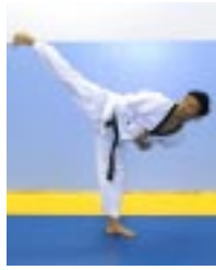
36)Step in front with left leg and execute a right leg side kick