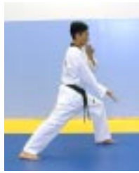
37)180° turn left land in front stance groin strike