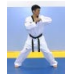
40)Step forward horse stance reinforced elbow hit