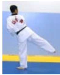
2)Right leg low side kick