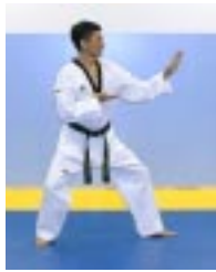
1)90° turn left back stance double knifehand body block