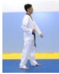
38)Left foot steps back into walking stance low block