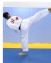
3)Right leg high side kick