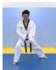
22)Land in front stance, left hand knee break Ki-hap