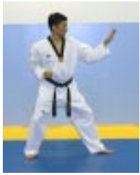
27)90° turn right pivot on left foot back stance knifehand block