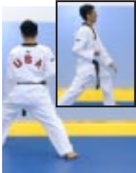
47)Left hand open hand low block