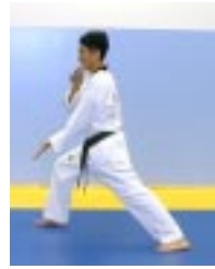
30)180° turn right land in front stance groin strike