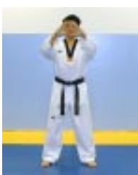
180° turn left pivot on right foot Koryo Finish Position