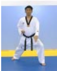
13)90° turn left pivot on right foot front stance, open hand low block