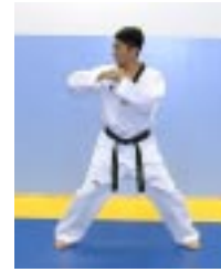
33)Step forward horse stance reinforced elbow hit