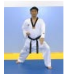
19)Land in front stance open hand low block