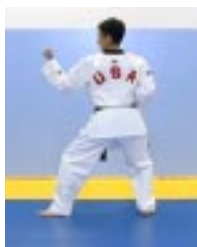
12)Left foot steps in pivot on right foot back stance inside body block