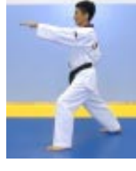
10)Land in front stance knifehand strike to neck