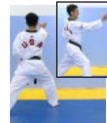
48)Step forward front stance choke grab Ki-hap