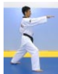
4)Land in front stance knifehand strike to neck