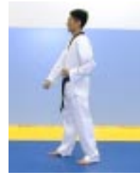
31)Step right leg back into walking stance low block