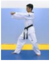
35)Left hand palm target punch